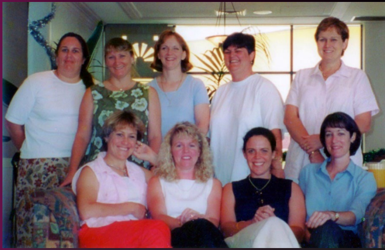
Qld Link Nurses and Drs (one day per fortnight)